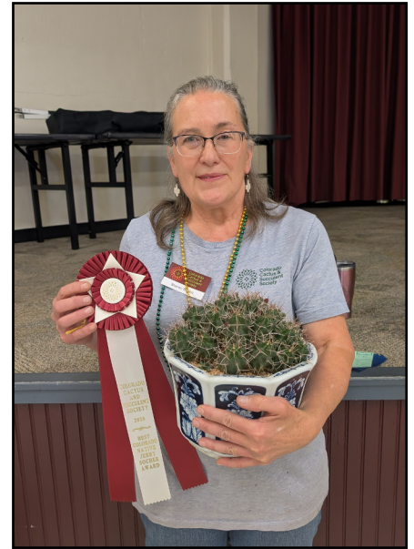
Best Colorado Native Echinocereus triglochidiatus Sharon Bolton