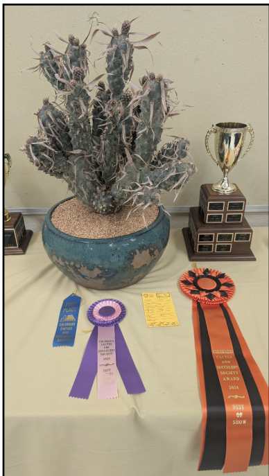
Best of Show Tephrocactus articulatus Justin Ruiz