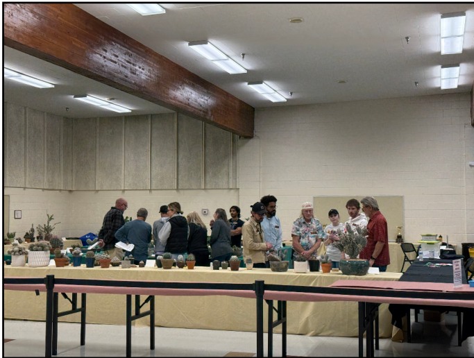
Plant Judging in Action!

The Summer Plant Conferences and Convention season is starting! We listed several here, including the Mid-States Conference and the Cactus & Succulent Society of America Show and Sale here. If you have not been to one, we can heartily recommend it!