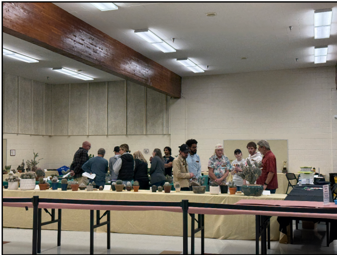
Plant Judging in Action!

The Summer Plant Conferences and Convention season is starting! We listed several here, including the Mid-States Conference and the Cactus & Succulent Society of America Show and Sale here. If you have not been to one, we can heartily recommend it!