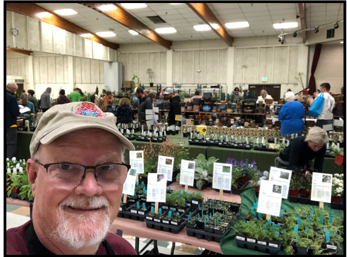
A 2024 Show and Sale Selfie!

The Colorado Cactus & Succulent Society promotes education, enjoyment, cultivation, and conservation of cacti and other succulents among our members and the larger community.