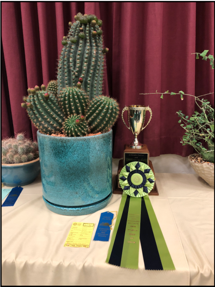
Best of Show Jeremy Marsh Echinopsis tricocereus hybrid 'Loivoides'