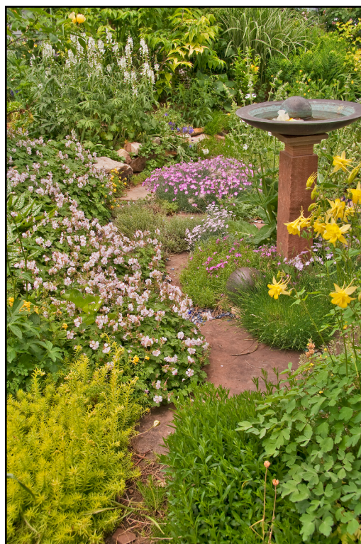
Front garden birdbath featuring Aquilegia chrysantha and Sidalcea candida

17156 East Berry Place Centennial, Colorado