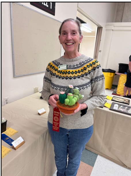
A Ribbon-Winning Pot of Cactus!