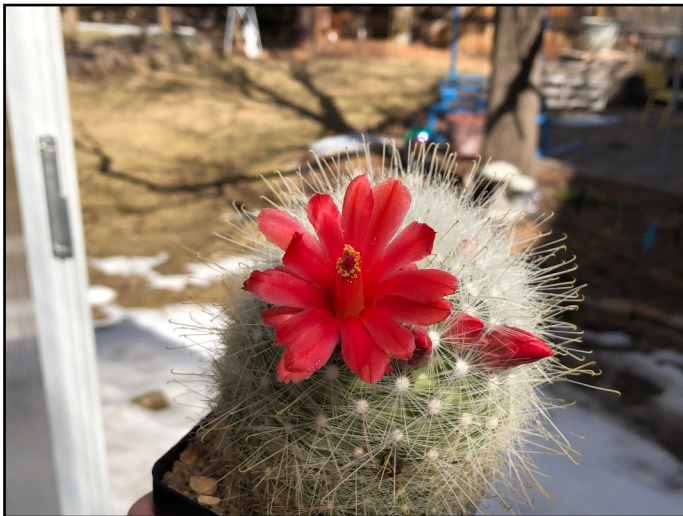
Mammillopsis senilis "Vegetable Velcro"

Plus, start looking through your plants to pick those show ribbon winners!