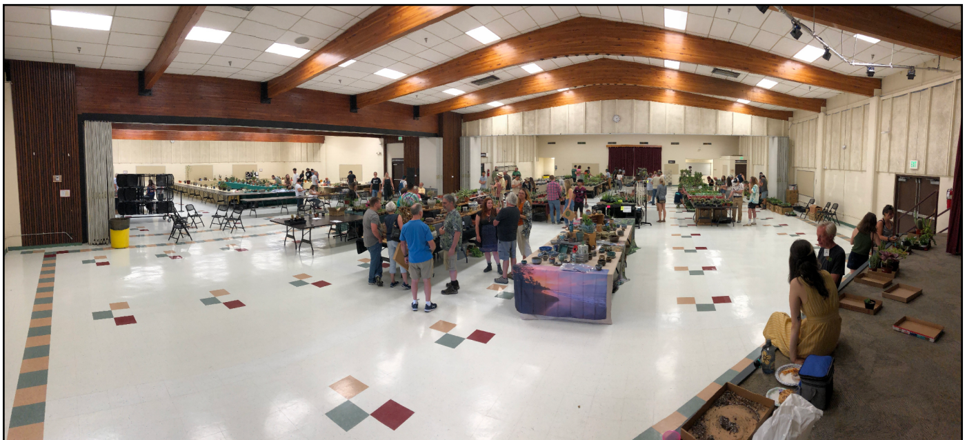
2021 CCSS Show and Sale Floor

See something you can do and would like to help? Contact me at seisnoir@comcast.net !