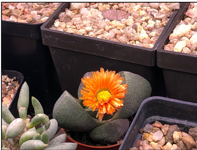
Pleiospilos nelii "Split Rock"

The Colorado Cactus & Succulent Society promotes education, enjoyment, cultivation, and conservation of cacti and other succulents among our members and the larger community.