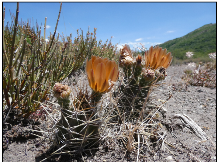
Austrocactus hibernus at Laguna Epulafquen