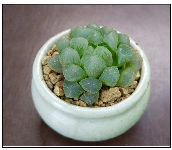
Haworthia cooperi truncata