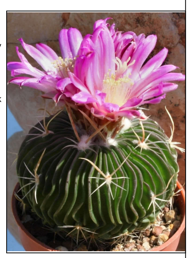
Stenocactus multicostatus