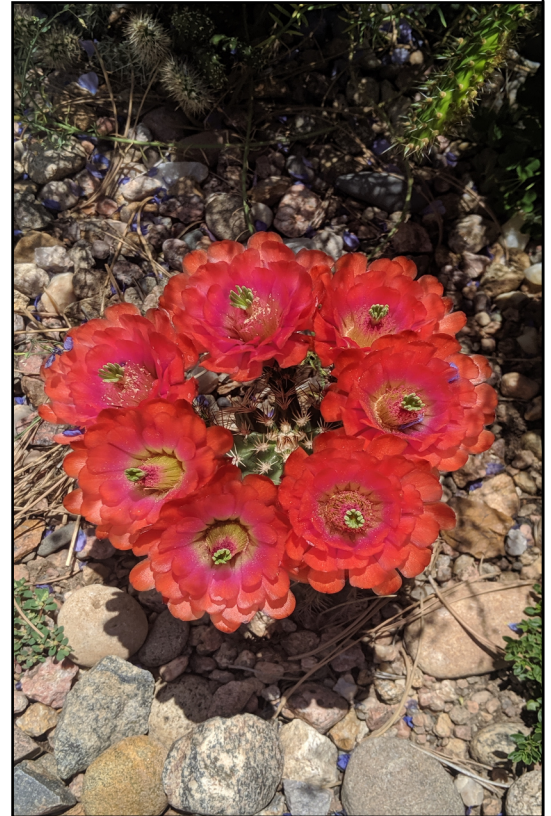
Echinocereus triglochidiatus

Echinocereus , is a genus of ribbed, usually small to medium-sized, cylindrical shaped cacti, comprising about 70 species native to the southern United States and Mexico. These cactus can be solitary but usually branching with large flowers and edible fruit. Several of the species are cold hardy, tolerating temperatures as low as -10^{\circ}\text{F} , but only in dry conditions. Our state cactus, the "Claret Cup Cactus" is Echinocereus triglochidiatus .