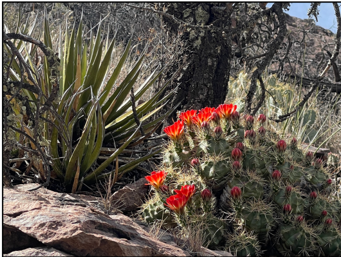
East Meets West

Remember, if the weather is poor next week, and it could be, to protect your plants from the cold!