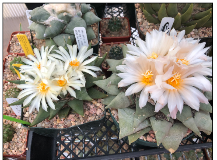
Ariocarpus - S Burkholder