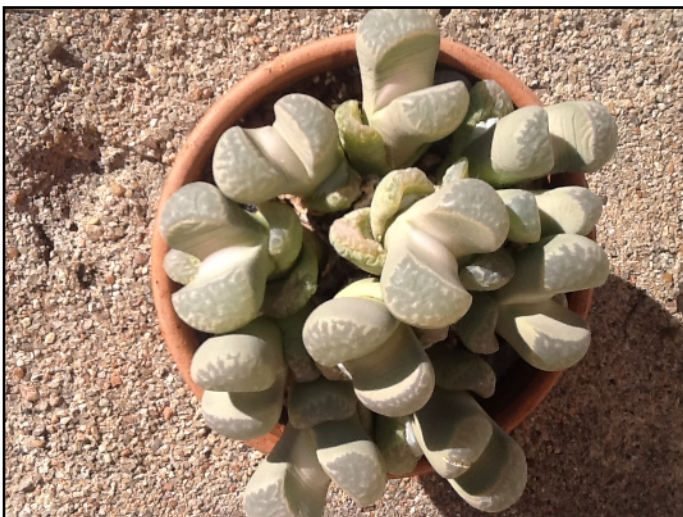
Mesembs - R Moehring