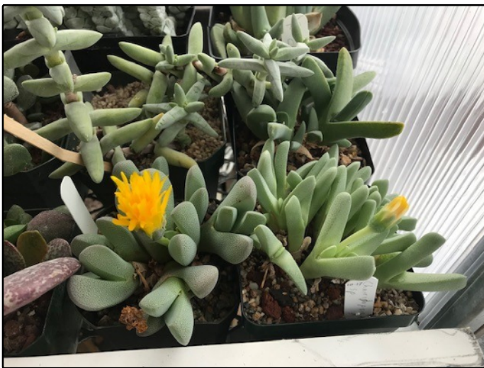
Mesembs