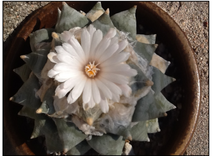
Ariocarpus - R Moehring