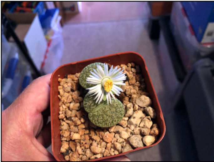
Lithops - S Burkholder