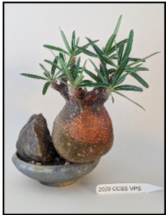
Pachypodium rosulatum gracilius