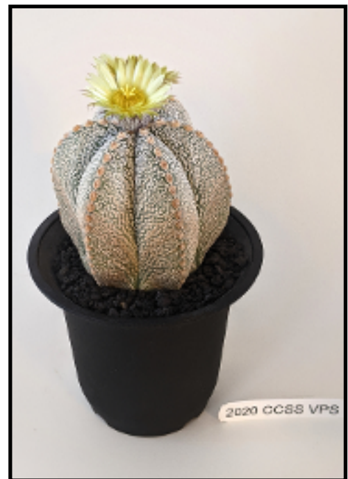
Astrophytum myriostigma 'Onzuka'

Watch for your chance to vote on the winner!