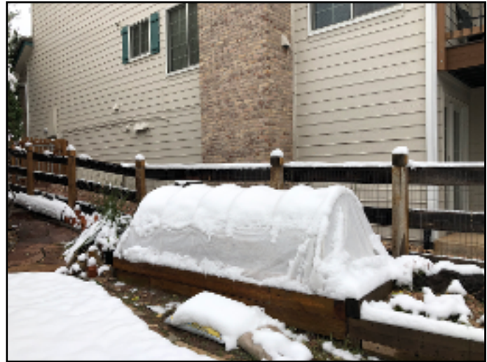
Our Cold Frame in the Snow

The Colorado Cactus & Succulent Society promotes education, enjoyment, cultivation, and conservation of cacti and other succulents among our members and the larger community.