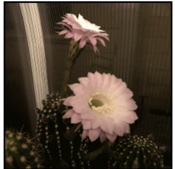
Echinopsos oxygona

Winter-Hardy Cactus and Succulents 501-786-5569 www.etsy.com/shop/denvercactusco