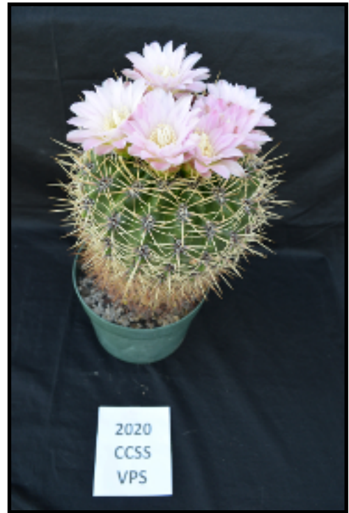
Gymnocalycium bauchii v. enorme