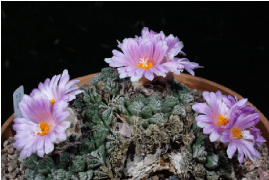
Ariocarpus fissuratus

We will hold elections for the CCSS Board of Directors this Saturday. Several positions are term limited and open, so if you would like to serve on the Board, this is your chance!