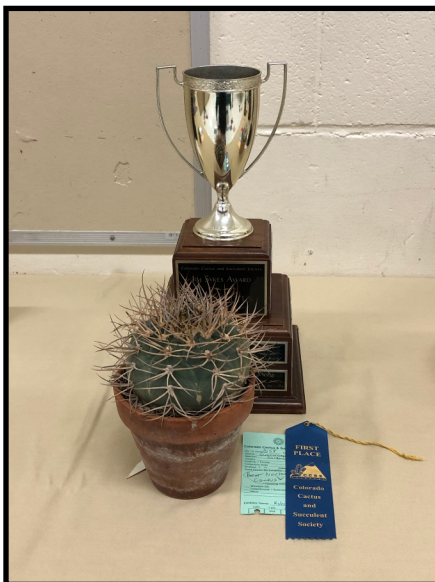
Gymnocalycium cardenasianum Kylee Hix