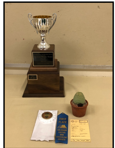
Pseudolithos eylensis

Get Your Plants Ready for Next Year, and Go for that Trophy!