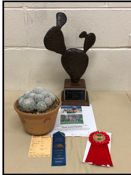
Mammillaria phimmera