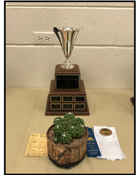
Echinocereus mojavensis 'inermis' Jackson Burkholder