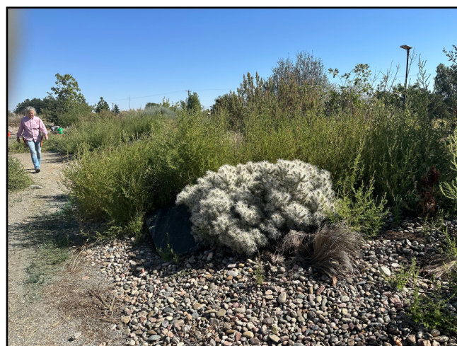
Panayoti Kelaidis Photo