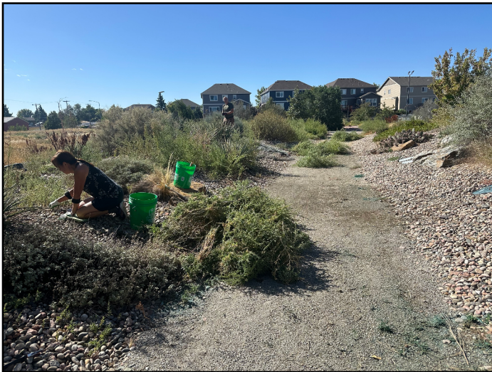
Gardening at APEX Project!

Consider joining the Board, and help lead the Club into the future!