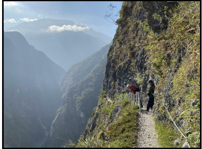
Field Botany on the Cliffs

The Colorado Cactus & Succulent Society promotes education, enjoyment, cultivation, and conservation of cacti and other succulents among our members and the larger community.