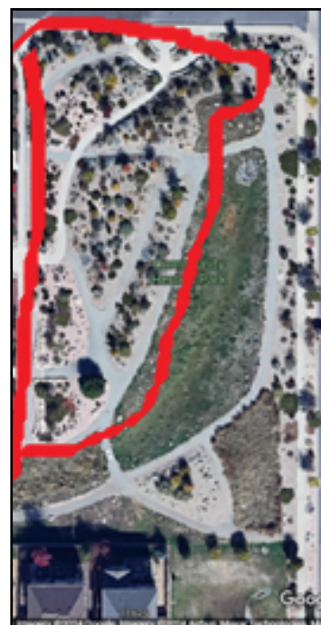
Panayoti Kelaidis Map