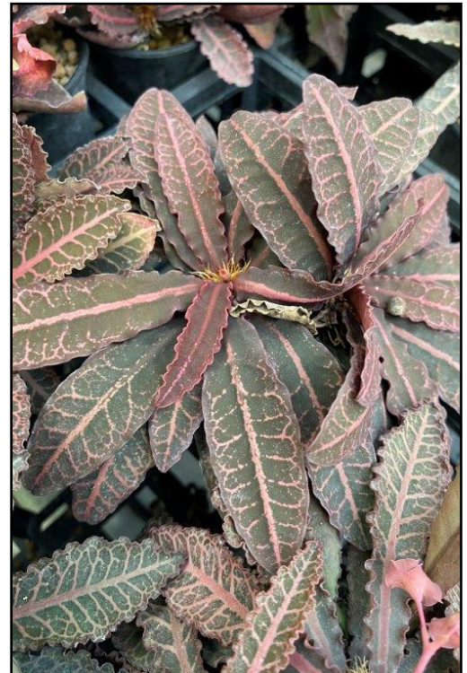
Dorstenia