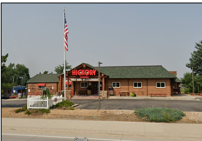
Hickory House Ribs

Otherwise, to use PayPal! Our account is >> coloradosucculent@gmail.com <<.