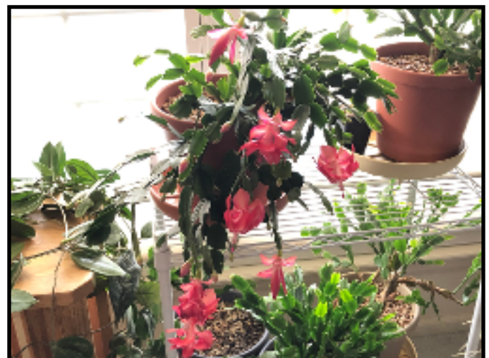
Schlumbergera truncata