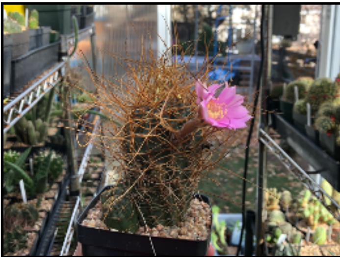
Lobivia winteriana

December's meeting is typically a potluck and features your photos. The final meeting of this year will be similar, you'll be eating food that you provide (at your home, of course) and you'll have a chance to show the Club those photos you've been hoarding during the coronavirus panic. Please send them to Randy Tatroe at rtatroe@q.com , otherwise you'll be seeing more of mine.