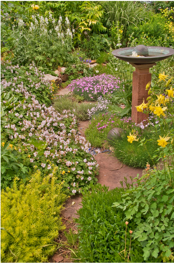
Tatroe birdbath, front garden, Aquilegia chrysantha , Sidalcea candida .

than 150 containers planted with cacti, succulents and annual and tropical flowers. A sizable collection of art is displayed throughout.